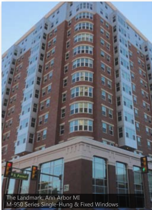
The Landmark, Ann Arbor MI M-950 Series Single-Hung & Fixed Windows

Our M-950 model is also available as Hurricane/ Impact-Resistant; ideal for housing in coastal regions.