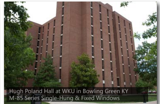
Hugh Poland Hall at WKU in Bowling Green KY M-85 Series Single-Hung & Fixed Windows