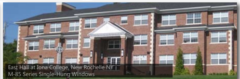
East Hall at Iona College, New Rochelle NY M-85 Series Single-Hung Windows

HQ/Sales/Manufacturing 217 Stover Rd. Charlevoix, MI 49720 (800) 632-9827 | fax (231) 547-4237