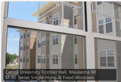
Carroll University Frontier Hall, Waukesha WI M-85 Series Single-Hung & Fixed Windows