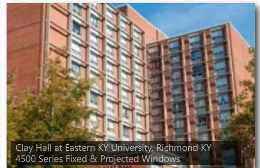
Clay Hall at Eastern KY University, Richmond KY 4500 Series Fixed & Projected Windows