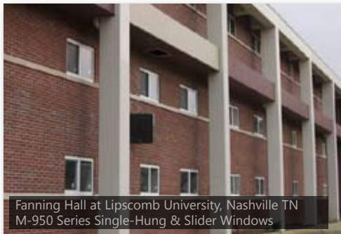
Fanning Hall at Lipscomb University, Nashville TN M-950 Series Single-Hung & Slider Windows