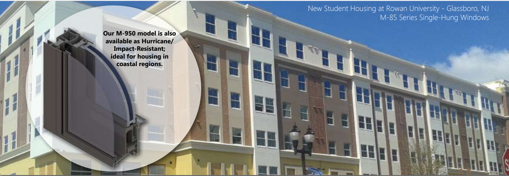
New Student Housing at Rowan University - Glassboro, NJ M-85 Series Single-Hung Windows

Our M-950 model is also available as Hurricane/ Impact-Resistant; ideal for housing in coastal regions.